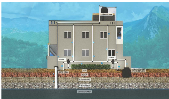
Recharge & Storage

We are authorized distributors of filters and related components for years. The filter operates based on various principles of detailed engineering, ensuring a dynamic filtration flow. Additionally, it provides comprehensive engineering solutions for rooftop filtration. Our systems are long-lasting, durable, and require minimal maintenance.